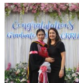
B. Business Management, 2020