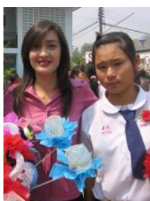
Grade 9, 2008